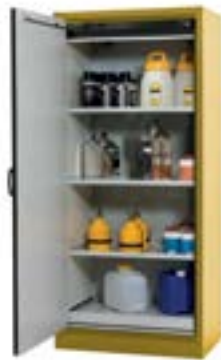
22601 with 22634