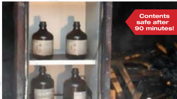
Contents remain intact after a 90-minute burn test.