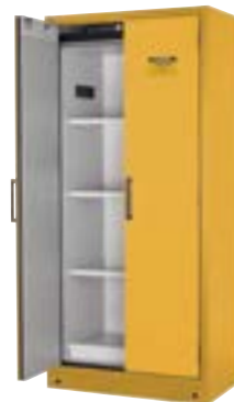
22605 with 22636